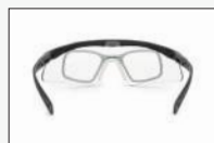
OPTIONAL RX CARRIER