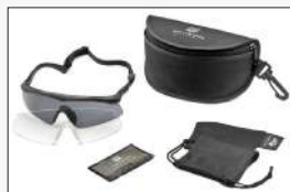
U.S. MILITARY KIT

AVAILABLE IN BLACK, TAN AND FOLIAGE GREEN