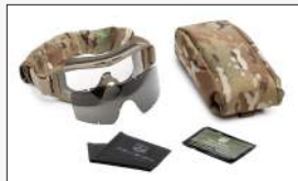
U.S. MILITARY TAN 499 KIT