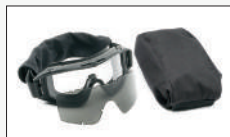
U.S. MILITARY KIT

SOLAR LENSES – Reduce extreme glare and squinting. Use outdoors in bright conditions.