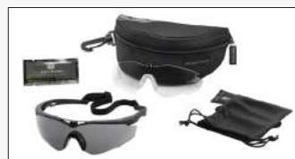
STINGERHAWK U.S. MILITARY KIT